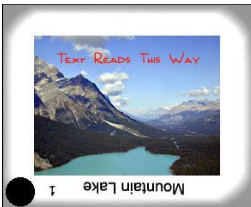
Front of Slide