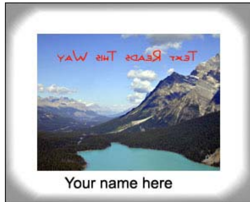
Back of Slide