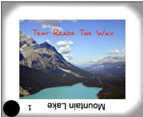
Front of Slide