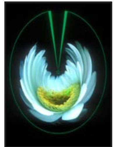
CREATIVE Slide of the Year Seymour Novins "White Petals"